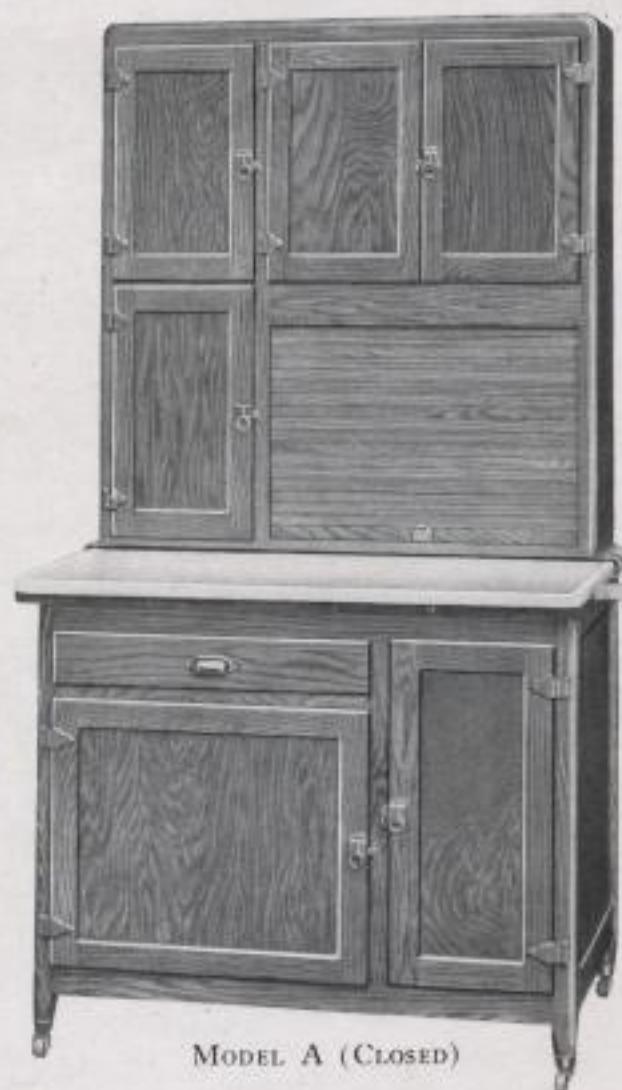
MODEL A (CLOSED)

A closed "Dutch Kitchenet" presents a most attractive appearance and harmonizes nicely with the other fixtures of the modern kitchen. With smooth panels and ends, rounded corners and edges, and the smooth roll curtain described elsewhere in this catalog, there is little chance for dust and dirt to collect on this cabinet and the smooth surfaces are very easy to keep clean. The base is supported by tapered legs, ferruled, and is high enough to sweep under. Latches, hinges and drawer pulls are of the best quality, nickel-plated. The latches are of the gravity type, which assure them operating perfectly throughout the life of the cabinet as there are no springs or other mechanism to get out of order.