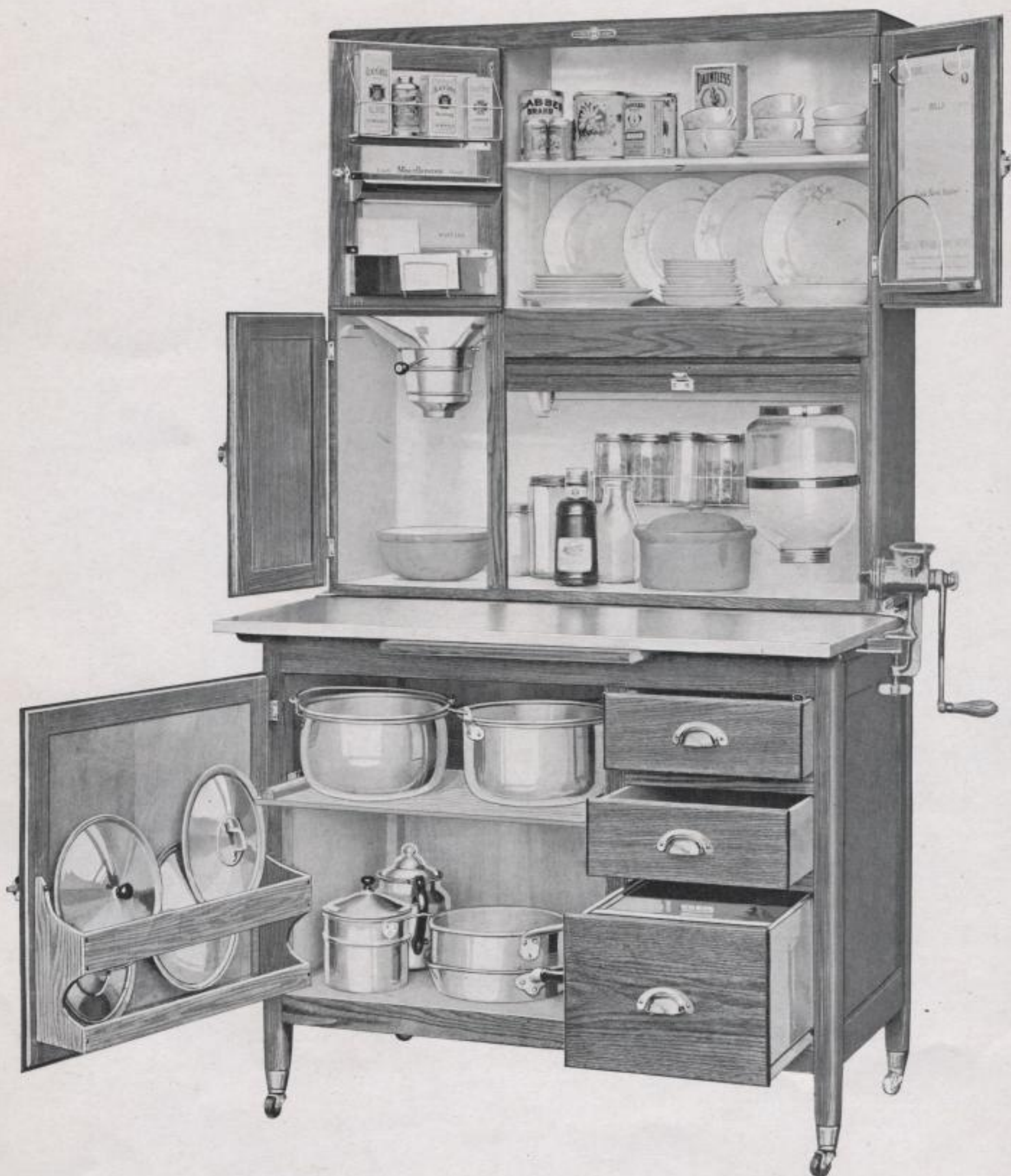
Model Z Height, 72 inches. Sliding Table, 25 x 40. Depth of Base, 21 inches.