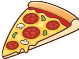
PLATE SAUCE SAUSAGE SLICE SPICY THE WORKS TOMATO TOPPINGS YEAST

E T S A E Y X R R K B X U D Y C P M C C E T A L P D M F L C U D I I N O R E P P E P T T O A L P Z M W U D X V L E W O L S S F A Z C O N U X I P A P K L T I H A L I S S V P Q P O L O S N B N F K A D E E F I Z A N M E V R R P U J R R P N R B I O K S O P A S D N S M G B T M O J W E E N A Q A A A S X A O R E R E E B G Q I Q R N L E D H G U O D H E E L Y H O J M T S S T S U R C G A R L I C Y H U P I Z Z A H U T Y V N H Z V M R E D R O V Y I Y T O U