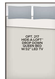
OPT. 217 HIDE-A-LOFT™ DROP DOWN QUEEN BED W/32" LED TV