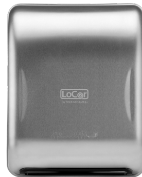
Stainless | D68012