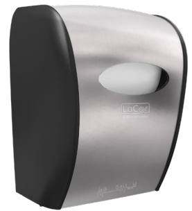
Stainless | D68004