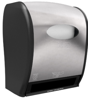
Stainless | D68001