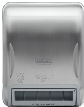
Stainless | D68011