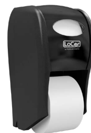
Black | D67013