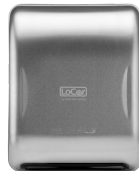
Stainless | D68012