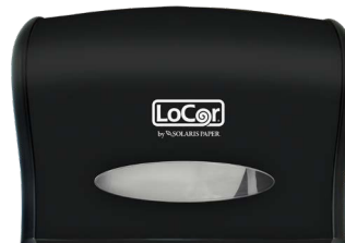
Black | D67033

LoCor® Jumbo Bath Tissue works with both Jumbo Bath Tissue dispensers to provide 1200 feet of continuous paper, right down to the core.