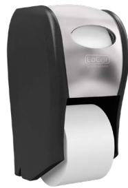
Stainless | D67011