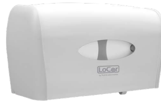
White | D67022