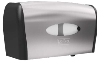
Stainless | D67021