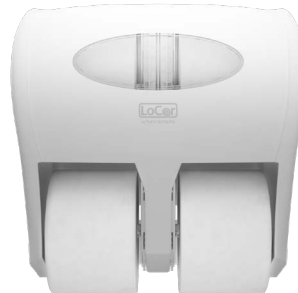
White | D67052