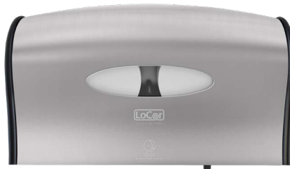
Stainless | D67041