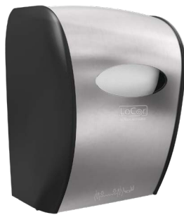
Stainless | D68004