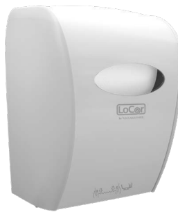
White | D68005