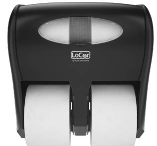
Black | D67053

For maximum efficiency, our high-capacity LoCor® bath tissue fits both side-by-side and top-down dispenser models, and is available in 1000, 1500 and 3000 sheet rolls.