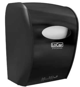
Black | D68006