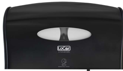
Black | D67043