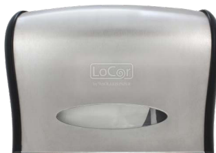
Stainless | D67031