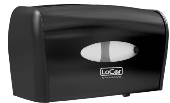
Black | D67023