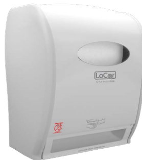
White | D68002