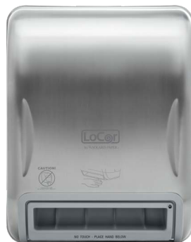
Stainless | D68011