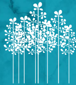
2. Responsibly Managed Plantations