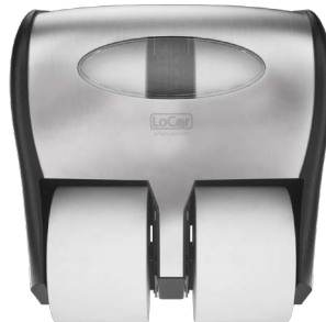
Stainless | D67051