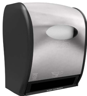
Stainless | D68001