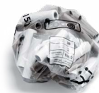
LoCor® Tissue vs Universal Bath Tissue (80 Roll / 500 Sheet Count)