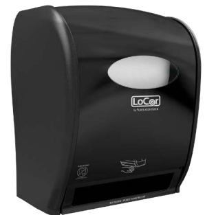
Black | D68003