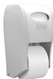
White | D67012