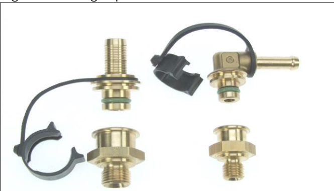
Fig. 6: Plugs disassembled