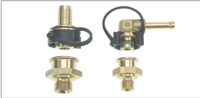
Fig. 3: Plugs and adapters in the initial position