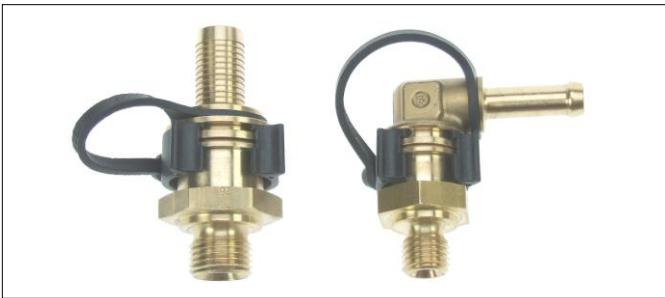
Fig. 4: Retaining clips locked