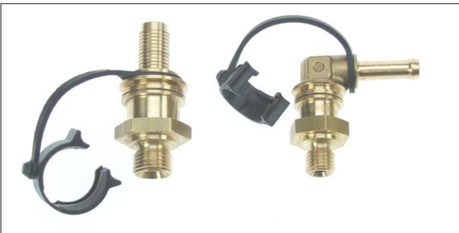
Fig. 5: Retaining clips removed